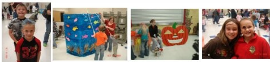
10/10/09 ~ CARNIVAL FUN BY ALL!